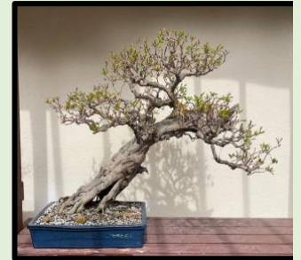
Pomegranate with new spring leaves. In the JFG collection.